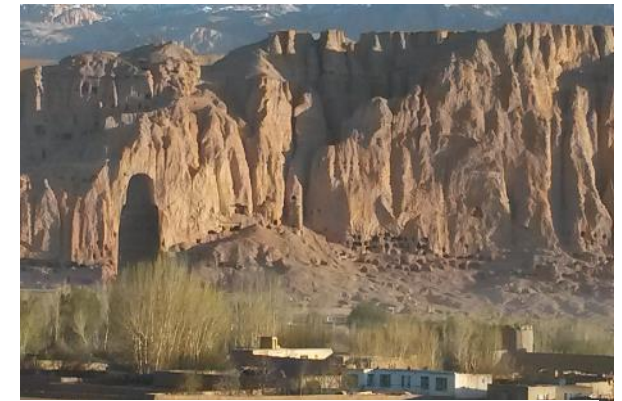
Project: Strategic Masterplan of Bamiyan, , Afghanistan, 2018

Courses will take place in Florence, since 1982 UNESCO World Heritage Site, at the Department of History, Archaeology, Geography and Fine Arts ( www.sagas.unifi.it ), rated among the excellent university departments in Italy. The University of Florence offers a wide range of services and facilities for international students.