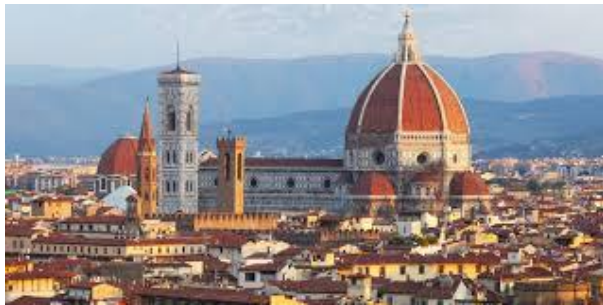
The course location: Florence UNESCO historic centre.

The course is designed for postgraduate students interested in developing advanced theoretical and methodological competences in a number of topics related to Geography, Spatial Management, Heritage and International Cooperation e.g.: valorization of cultural heritage and sustainable tourism, integrated planning and design of urban and territorial development, GIS, remote sensing and Big Data.