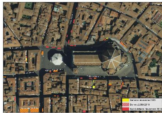
Project: outdoor cafes and public space in Florence, 2017

On the second year the students have at their disposal a wide range of courses that they can choose from according to their personal interests. The educational offer is provided in close relationship with two Laboratories of Excellence: the Social Geography Laboratory - LaGeS ( www.lages.eu ) and the Applied Geography Laboratory - LabGeo ( www.geografia-applicata.it ). Furthermore, the teaching staff will guide the students into internships and traineeships in public and private institutions in the fields of spatial analysis, territorial planning and international cooperation.